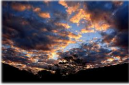
Closing Sacred Space