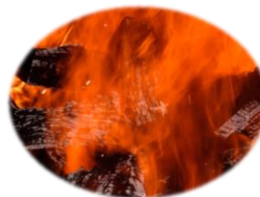
Ground and Close