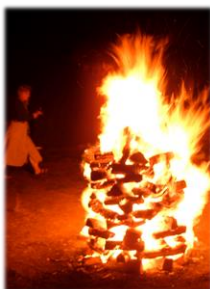
Sacred Space Dance