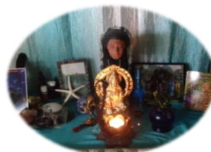
Set an Intention for this moon cycle...